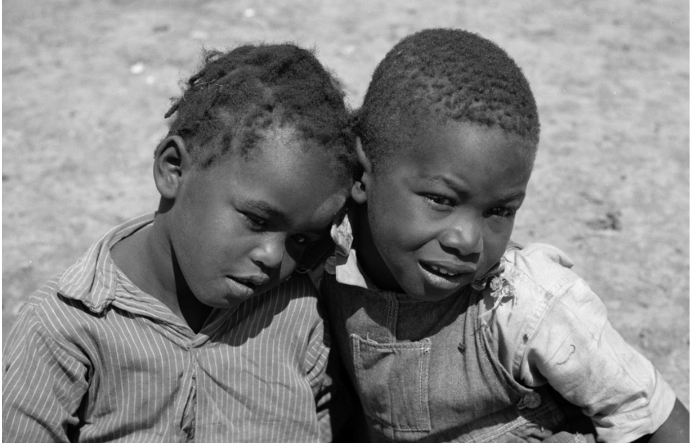
Sharecropper boys in 1936